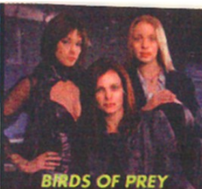
BIRDS OF PREY